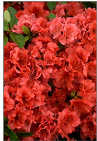
Girard's Hot Shot Azalea flowers