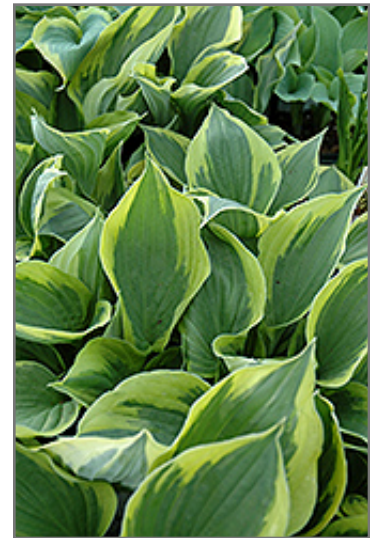
Twilight Hosta foliage

Twilight Hosta is recommended for the following landscape applications;