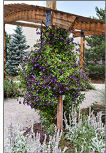
Jackmanii Superba Clematis in bloom

Jackmanii Superba Clematis makes a fine choice for the outdoor landscape, but it is also well-suited for use in outdoor pots and containers. Because of its spreading habit of growth, it is ideally suited for use as a 'spiller' in the 'spiller-thriller-filler' container combination; plant it near the edges where it can spill gracefully over the pot. It is even sizeable enough that it can be grown alone in a suitable container. Note that when grown in a container, it may not perform exactly as indicated on the tag - this is to be expected. Also note that when growing plants in outdoor containers and baskets, they may require more frequent waterings than they would in the yard or garden.