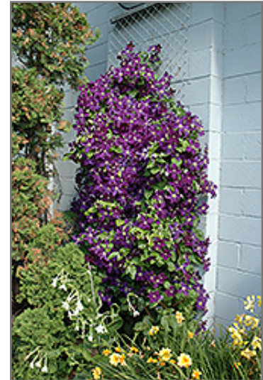
Jackmanii Superba Clematis in bloom