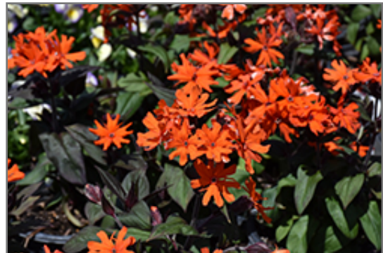
Orange Gnome Champion flowers