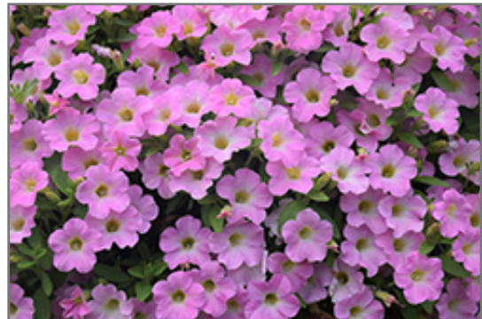
Itsy Pink Petunia flowers

This plant will require occasional maintenance and upkeep. Trim off the flower heads after they fade and die to encourage more blooms late into the season. It is a good choice for attracting bees, butterflies and hummingbirds to your yard, but is not particularly attractive to deer who tend to leave it alone in favor of tastier treats. It has no significant negative characteristics.