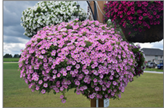
Itsy Pink Petunia in bloom

Itsy Pink Petunia is a fine choice for the garden, but it is also a good selection for planting in outdoor containers and hanging baskets. Because of its trailing habit of growth, it is ideally suited for use as a 'spiller' in the 'spiller-thriller-filler' container combination; plant it near the edges where it can spill gracefully over the pot. Note that when growing plants in outdoor containers and baskets, they may require more frequent waterings than they would in the yard or garden.