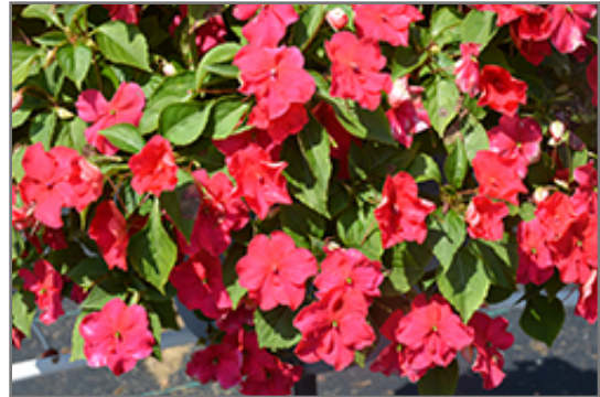
Beacon Lipstick Impatiens flowers