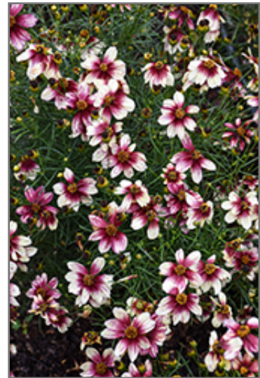
Sizzle And SpiceZesty Zinger Tickseed flowers

Sizzle And SpiceZesty Zinger Tickseed is recommended for the following landscape applications;