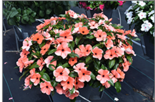
Tattoo Orange Vinca in bloom

Tattoo Orange Vinca is a fine choice for the garden, but it is also a good selection for planting in outdoor containers and hanging baskets. It is often used as a 'filler' in the 'spiller-thriller-filler' container combination, providing a mass of flowers against which the thriller plants stand out. Note that when growing plants in outdoor containers and baskets, they may require more frequent waterings than they would in the yard or garden.