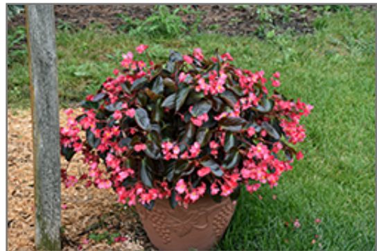
Dragon Wing Pink Bronze Leaf Begonia in bloom