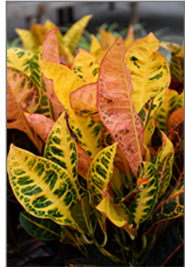
Petra Variegated Croton foliage