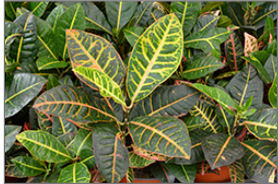
Petra Variegated Croton foliage

Petra Variegated Croton is a fine choice for the garden, but it is also a good selection for planting in outdoor pots and containers. With its upright habit of growth, it is best suited for use as a 'thriller' in the 'spiller-thriller-filler' container combination; plant it near the center of the pot, surrounded by smaller plants and those that spill over the edges. It is even sizeable enough that it can be grown alone in a suitable container. Note that when growing plants in outdoor containers and baskets, they may require more frequent waterings than they would in the yard or garden. Be aware that in our climate, this plant may be too tender to survive the winter if left outdoors in a container. Contact our experts for more information on how to protect it over the winter months.