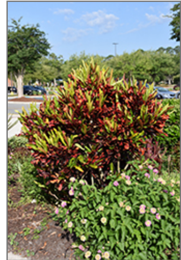
Mammy Croton