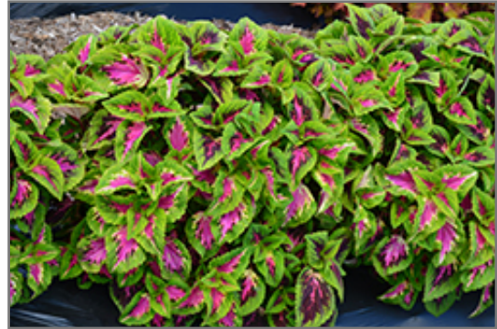
French Quarter Coleus

French Quarter Coleus will grow to be about 24 inches tall at maturity, with a spread of 18 inches. When grown in masses or used as a bedding plant, individual plants should be spaced approximately 15 inches apart. Although it's not a true annual, this fast-growing plant can be expected to behave as an annual in our climate if left outdoors over the winter, usually needing replacement the following year. As such, gardeners should take into consideration that it will perform differently than it would in its native habitat.