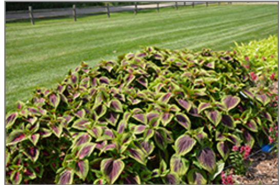
French Quarter Coleus