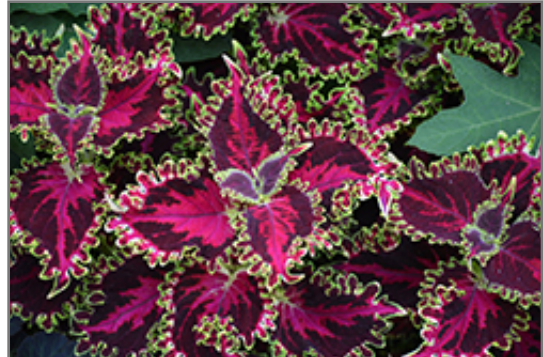
Volcanica Solar Flare Coleus foliage

Volcanica Solar Flare Coleus is recommended for the following landscape applications;