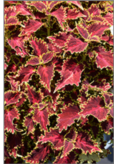
Volcanica Solar Flare Coleus foliage

Volcanica Solar Flare Coleus is a fine choice for the garden, but it is also a good selection for planting in outdoor containers and hanging baskets. It can be used either as 'filler' or as a 'thriller' in the 'spiller-thriller-filler' container combination, depending on the height and form of the other plants used in the container planting. It is even sizeable enough that it can be grown alone in a suitable container. Note that when growing plants in outdoor containers and baskets, they may require more frequent waterings than they would in the yard or garden.