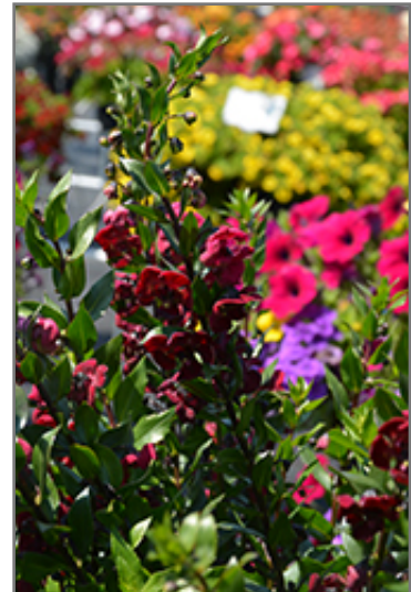
Archangel Ruby Sangria Angelonia flowers