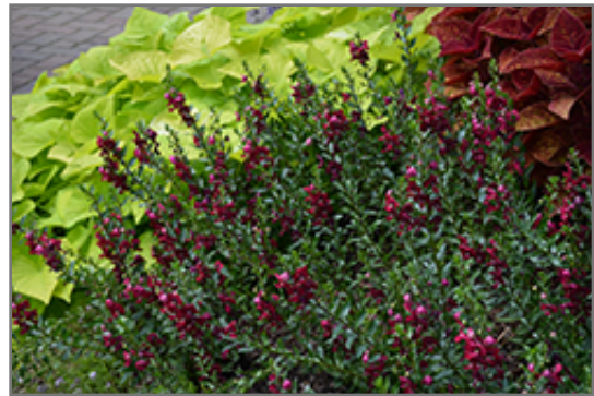
Archangel Ruby Sangria Angelonia in bloom