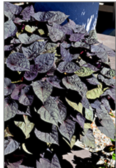
Spotlight Black Heart Sweet Potato Vine foliage