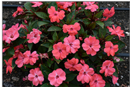
Solarscape Orange Burst Impatiens flowers