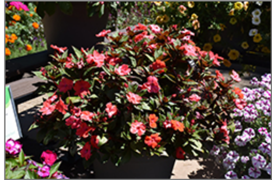
Solarscape Orange Burst Impatiens in bloom

Solarscape Orange Burst Impatiens will grow to be about 9 inches tall at maturity, with a spread of 20 inches. When grown in masses or used as a bedding plant, individual plants should be spaced approximately 14 inches apart. Its foliage tends to remain low and dense right to the ground. This fast-growing annual will normally live for one full growing season, needing replacement the following year.