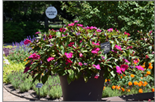
Solarscape Magenta Bliss Impatiens in bloom

Solarscape Magenta Bliss Impatiens will grow to be about 9 inches tall at maturity, with a spread of 20 inches. When grown in masses or used as a bedding plant, individual plants should be spaced approximately 14 inches apart. Its foliage tends to remain low and dense right to the ground. This fast-growing annual will normally live for one full growing season, needing replacement the following year.