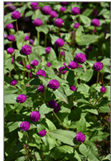
Pinball Purple Globe Amaranth flowers