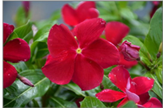
Titan Cranberry Vinca flowers