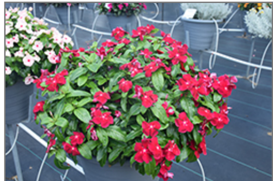
Titan Cranberry Vinca in bloom

Titan Cranberry Vinca will grow to be about 14 inches tall at maturity, with a spread of 12 inches. Its foliage tends to remain dense right to the ground, not requiring facer plants in front. Although it's not a true annual, this fast-growing plant can be expected to behave as an annual in our climate if left outdoors over the winter, usually needing replacement the following year. As such, gardeners should take into consideration that it will perform differently than it would in its native habitat.