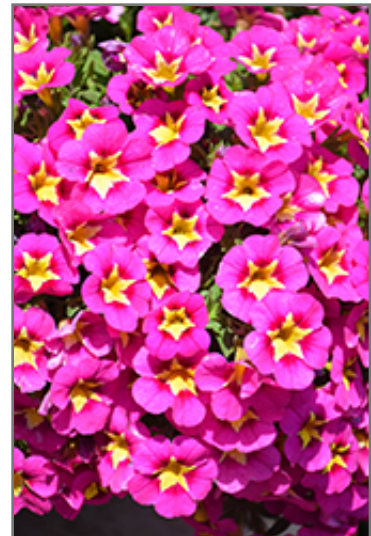
Bumble Bee Hot Pink Calibrachoa flowers

Bumble Bee Hot Pink Calibrachoa is recommended for the following landscape applications;