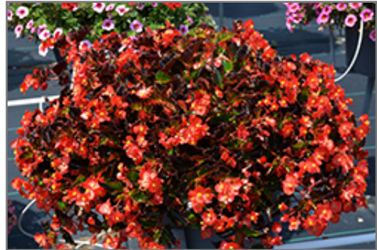
Hula Red Begonia in bloom