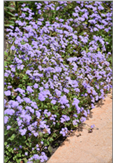
Aguilera Sky Blue Flossflower in bloom