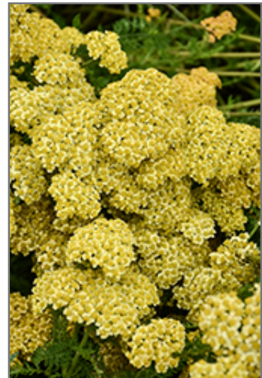
Milly Rock Yellow Terracotta Yarrow flowers