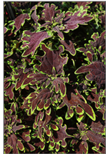
Limewire Coleus foliage