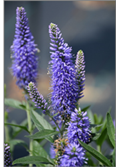
Skyward Blue Long-leaf Speedwell flowers

Skyward Blue Long-leaf Speedwell is a fine choice for the garden, but it is also a good selection for planting in outdoor pots and containers. It is often used as a 'filler' in the 'spiller-thriller-filler' container combination, providing a mass of flowers against which the larger thriller plants stand out. Note that when growing plants in outdoor containers and baskets, they may require more frequent waterings than they would in the yard or garden.