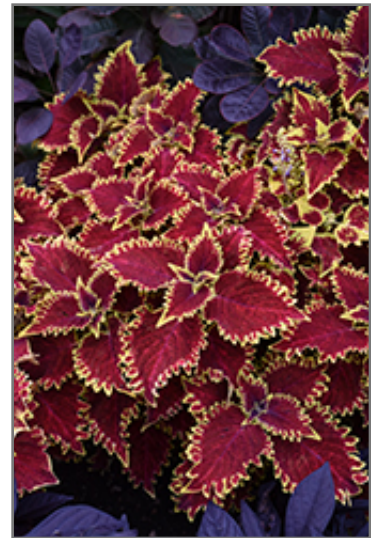
Copperhead Coleus foliage