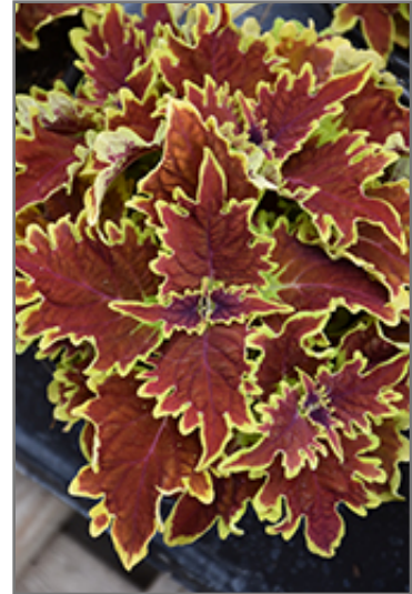
Copperhead Coleus foliage

Copperhead Coleus is a fine choice for the garden, but it is also a good selection for planting in outdoor containers and hanging baskets. With its upright habit of growth, it is best suited for use as a 'thriller' in the 'spiller-thriller-filler' container combination; plant it near the center of the pot, surrounded by smaller plants and those that spill over the edges. Note that when growing plants in outdoor containers and baskets, they may require more frequent waterings than they would in the yard or garden.