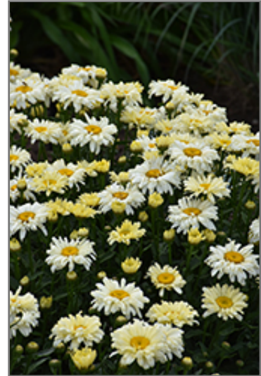
Amazing Daisies Banana Cream II Shasta Daisy flowers

Amazing Daisies Banana Cream II Shasta Daisy will grow to be about 20 inches tall at maturity, with a spread of 22 inches. When grown in masses or used as a bedding plant, individual plants should be spaced approximately 20 inches apart. It grows at a fast rate, and under ideal conditions can be expected to live for approximately 5 years. As an herbaceous perennial, this plant will usually die back to the crown each winter, and will regrow from the base each spring. Be careful not to disturb the crown in late winter when it may not be readily seen!