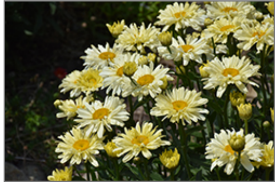
Amazing Daisies Banana Cream II Shasta Daisy flowers

This plant will require occasional maintenance and upkeep, and should be cut back in late fall in preparation for winter. It is a good choice for attracting butterflies to your yard. Gardeners should be aware of the following characteristic(s) that may warrant special consideration;