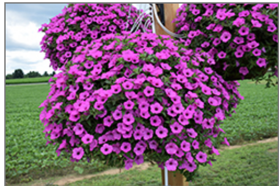
Supertunia Vista Jazzberry Petunia in bloom