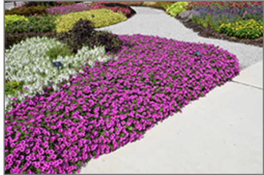
Supertunia Vista Jazzberry Petunia in bloom

Supertunia Vista Jazzberry Petunia is a fine choice for the garden, but it is also a good selection for planting in outdoor containers and hanging baskets. Because of its trailing habit of growth, it is ideally suited for use as a 'spiller' in the 'spiller-thriller-filler' container combination; plant it near the edges where it can spill gracefully over the pot. It is even sizeable enough that it can be grown alone in a suitable container. Note that when growing plants in outdoor containers and baskets, they may require more frequent waterings than they would in the yard or garden.