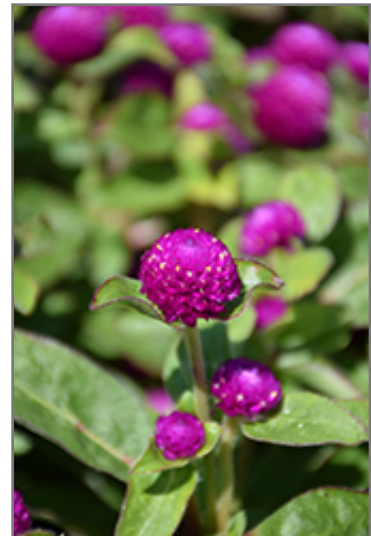
Gnome Purple Gomphrena flowers

Gnome Purple Gomphrena is recommended for the following landscape applications;