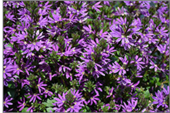
Surdiva Purple Fan Flower flowers

Surdiva Purple Fan Flower is recommended for the following landscape applications;