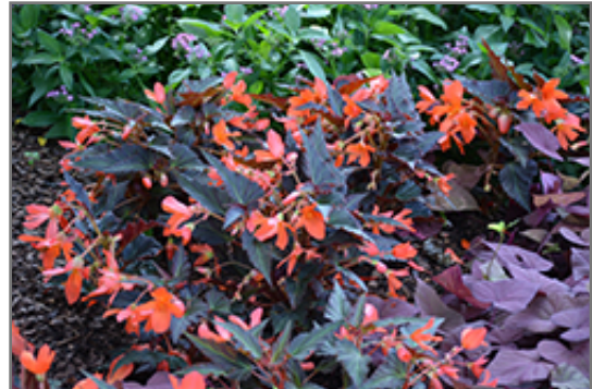
'Conia Upright Fire Begonia in bloom