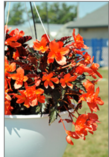
'Conia Upright Fire Begonia in bloom