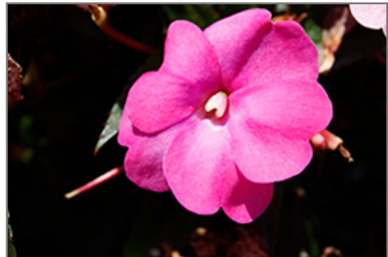
SunPatiens Compact Hot Pink New Guinea Impatiens flowers

SunPatiens Compact Hot Pink New Guinea Impatiens is recommended for the following landscape applications;