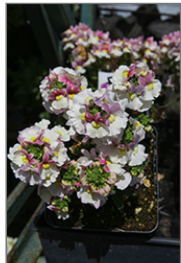
Escential Pinkberry Nemesia flowers