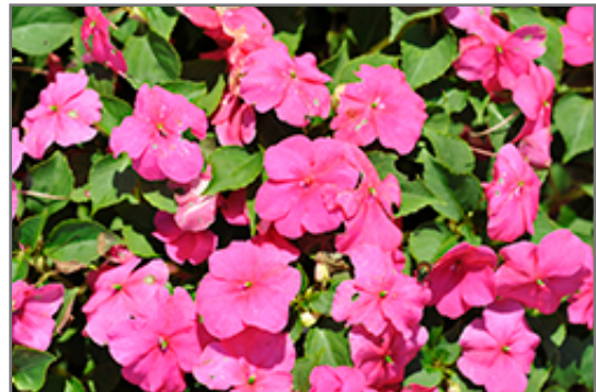
Beacon Rose Impatiens flowers

Beacon Rose Impatiens is recommended for the following landscape applications;