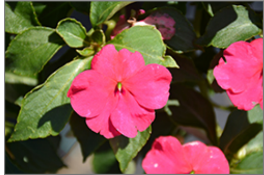
Beacon Rose Impatiens flowers

Beacon Rose Impatiens will grow to be about 15 inches tall at maturity, with a spread of 12 inches. When grown in masses or used as a bedding plant, individual plants should be spaced approximately 8 inches apart. Its foliage tends to remain dense right to the ground, not requiring facer plants in front. This fast-growing annual will normally live for one full growing season, needing replacement the following year.