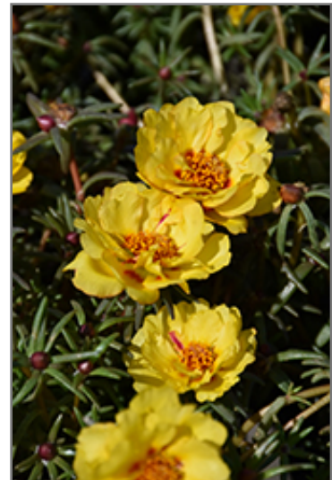
Happy Hour Banana Portulaca flowers

Happy Hour Banana Portulaca is recommended for the following landscape applications;