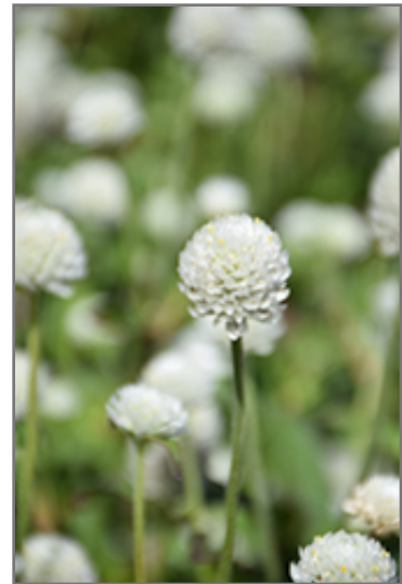
Ping Pong White Globe Amaranth flowers

Ping Pong White Globe Amaranth is recommended for the following landscape applications;