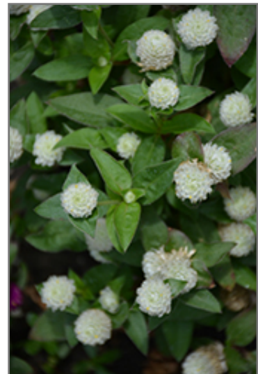
Ping Pong White Globe Amaranth flowers