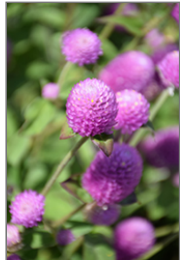
Ping Pong Lavender Globe Amaranth flowers

Ping Pong Lavender Globe Amaranth is recommended for the following landscape applications;