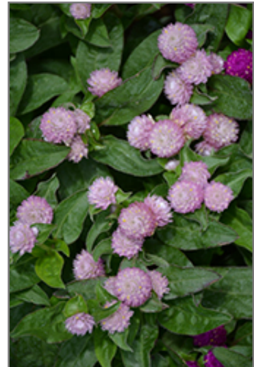
Ping Pong Lavender Globe Amaranth flowers