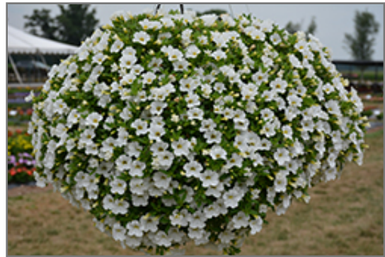
MiniFamous Uno White Calibrachoa in bloom

MiniFamous Uno White Calibrachoa is a fine choice for the garden, but it is also a good selection for planting in outdoor containers and hanging baskets. Because of its trailing habit of growth, it is ideally suited for use as a 'spiller' in the 'spiller-thriller-filler' container combination; plant it near the edges where it can spill gracefully over the pot. Note that when growing plants in outdoor containers and baskets, they may require more frequent waterings than they would in the yard or garden.