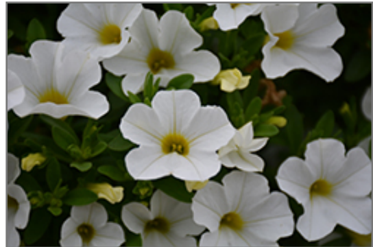
MiniFamous Uno White Calibrachoa flowers