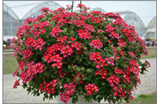
Cadet Upright Red Verbena in bloom

Cadet Upright Red Verbena will grow to be about 10 inches tall at maturity, with a spread of 14 inches. When grown in masses or used as a bedding plant, individual plants should be spaced approximately 10 inches apart. Its foliage tends to remain low and dense right to the ground. This fast-growing annual will normally live for one full growing season, needing replacement the following year.