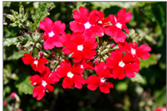
Cadet Upright Red Verbena flowers

Cadet Upright Red Verbena is recommended for the following landscape applications;