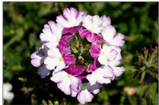
Firehouse Purple Fizz Verbena flowers