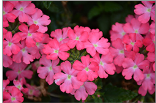
Firehouse Pink Verbena flowers