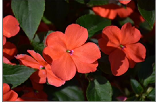
Beacon Salmon Impatiens flowers

Beacon Salmon Impatiens will grow to be about 15 inches tall at maturity, with a spread of 12 inches. When grown in masses or used as a bedding plant, individual plants should be spaced approximately 8 inches apart. Its foliage tends to remain dense right to the ground, not requiring facer plants in front. This fast-growing annual will normally live for one full growing season, needing replacement the following year.