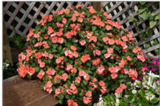
Beacon Salmon Impatiens in bloom

Beacon Salmon Impatiens is recommended for the following landscape applications;