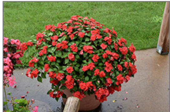
Beacon Bright Red Impatiens flowers

Beacon Bright Red Impatiens is recommended for the following landscape applications;