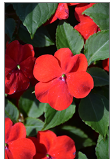
Beacon Bright Red Impatiens flowers