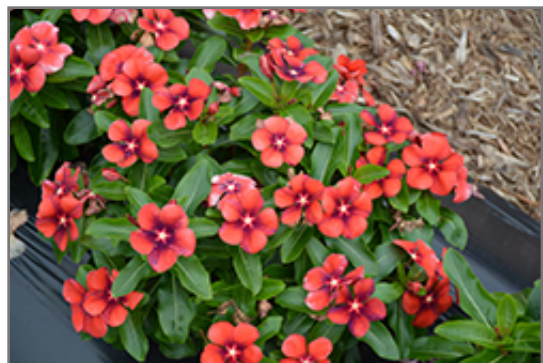
Tattoo Tangerine Vinca in bloom