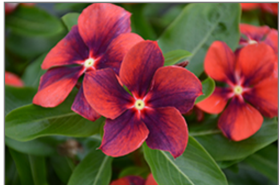
Tattoo Tangerine Vinca flowers

This plant will require occasional maintenance and upkeep, and should not require much pruning, except when necessary, such as to remove dieback. It is a good choice for attracting butterflies to your yard, but is not particularly attractive to deer who tend to leave it alone in favor of tastier treats. It has no significant negative characteristics.