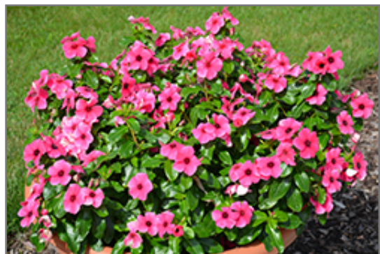
Tattoo Raspberry Vinca in bloom