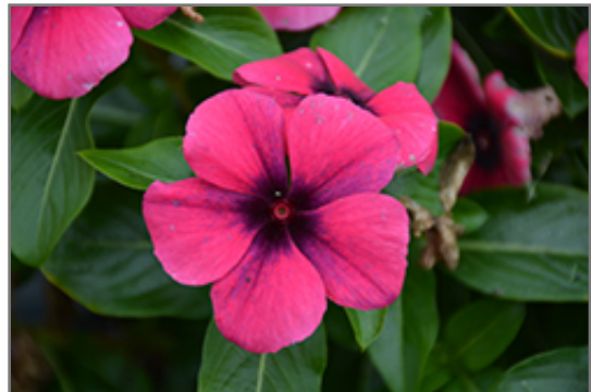
Tattoo Raspberry Vinca flowers

This plant will require occasional maintenance and upkeep, and should not require much pruning, except when necessary, such as to remove dieback. It is a good choice for attracting butterflies to your yard, but is not particularly attractive to deer who tend to leave it alone in favor of tastier treats. It has no significant negative characteristics.