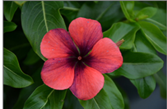
Tattoo Papaya Vinca flowers

This plant will require occasional maintenance and upkeep, and should not require much pruning, except when necessary, such as to remove dieback. It is a good choice for attracting butterflies to your yard, but is not particularly attractive to deer who tend to leave it alone in favor of tastier treats. It has no significant negative characteristics.