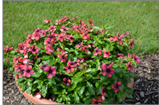
Tattoo Papaya Vinca in bloom

Tattoo Papaya Vinca is a fine choice for the garden, but it is also a good selection for planting in outdoor containers and hanging baskets. It is often used as a 'filler' in the 'spiller-thriller-filler' container combination, providing a mass of flowers against which the thriller plants stand out. Note that when growing plants in outdoor containers and baskets, they may require more frequent waterings than they would in the yard or garden.