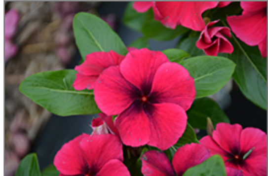
Tattoo Black Cherry Vinca flowers

This plant will require occasional maintenance and upkeep, and should not require much pruning, except when necessary, such as to remove dieback. It is a good choice for attracting butterflies to your yard, but is not particularly attractive to deer who tend to leave it alone in favor of tastier treats. It has no significant negative characteristics.