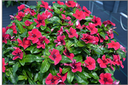
Tattoo Black Cherry Vinca in bloom

Tattoo Black Cherry Vinca is a fine choice for the garden, but it is also a good selection for planting in outdoor containers and hanging baskets. It is often used as a 'filler' in the 'spiller-thriller-filler' container combination, providing a mass of flowers against which the thriller plants stand out. Note that when growing plants in outdoor containers and baskets, they may require more frequent waterings than they would in the yard or garden.