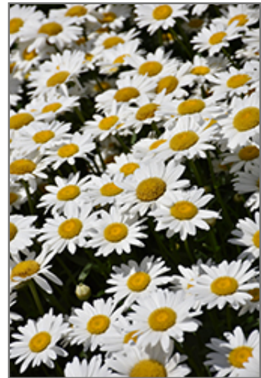
Becky Shasta Daisy flowers