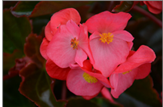
Megawatt Rose Bronze Leaf Begonia flowers

Megawatt Rose Bronze Leaf Begonia is an herbaceous annual with an upright spreading habit of growth. Its medium texture blends into the garden, but can always be balanced by a couple of finer or coarser plants for an effective composition.