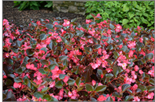
Megawatt Rose Bronze Leaf Begonia in bloom

Megawatt Rose Bronze Leaf Begonia is a fine choice for the garden, but it is also a good selection for planting in outdoor containers and hanging baskets. With its upright habit of growth, it is best suited for use as a 'thriller' in the 'spiller-thriller-filler' container combination; plant it near the center of the pot, surrounded by smaller plants and those that spill over the edges. It is even sizeable enough that it can be grown alone in a suitable container. Note that when growing plants in outdoor containers and baskets, they may require more frequent waterings than they would in the yard or garden.