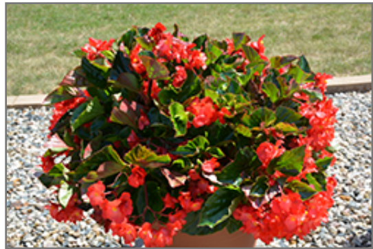
Megawatt Red Green Leaf Begonia in bloom

Megawatt Red Green Leaf Begonia is a fine choice for the garden, but it is also a good selection for planting in outdoor containers and hanging baskets. With its upright habit of growth, it is best suited for use as a 'thriller' in the 'spiller-thriller-filler' container combination; plant it near the center of the pot, surrounded by smaller plants and those that spill over the edges. It is even sizeable enough that it can be grown alone in a suitable container. Note that when growing plants in outdoor containers and baskets, they may require more frequent waterings than they would in the yard or garden.